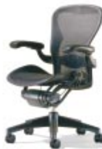
Aeron Work Chair

Herman Miller builds the Aeron chair responsibly, conscious of its environmental impact. Many of its parts are made from recycled materials, including the base, which is recycled aluminum, and the frame, made from recycled polymer.