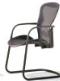
Aeron Side Chair